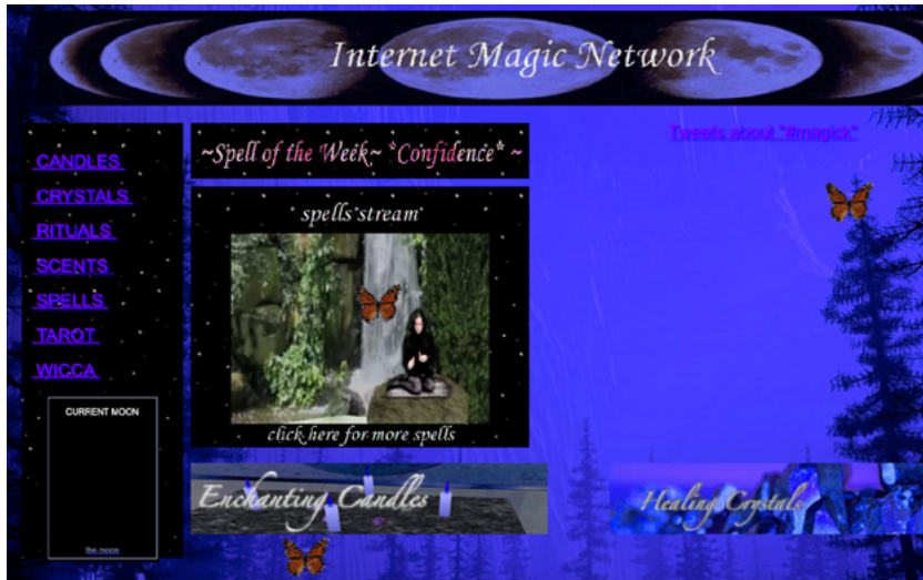
Finished art work example by the artist